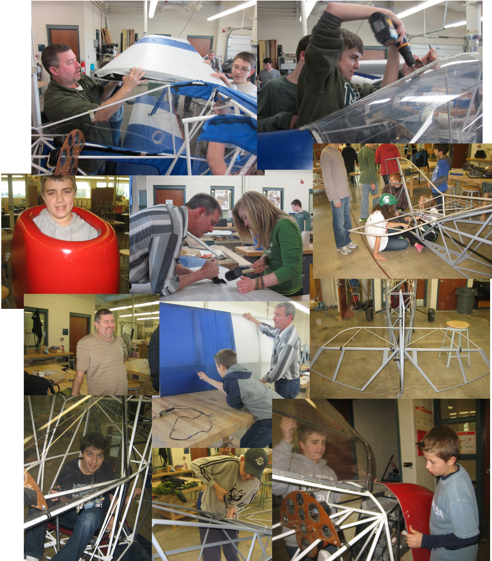
A pessimist see a problem with every opportunity. An optimist sees an opportunity with every problem